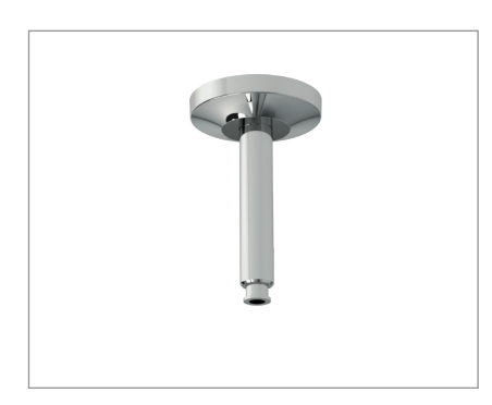
TS110MC6: Rain Shower Arm Ceiling Mount 6"