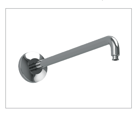
TBW07025U: Rain Shower Arm Wall-Mount,16"

Please note the following components are sold separately